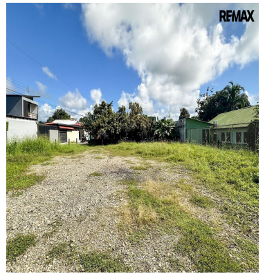
SEE PROPERTY ON GOOGLE MAPS