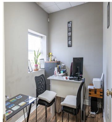
SEE PROPERTY ON GOOGLE MAPS