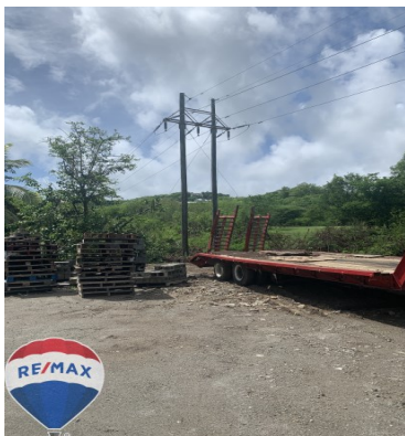
SEE PROPERTY ON GOOGLE MAPS