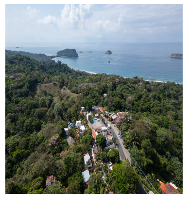
SEE PROPERTY ON GOOGLE MAPS