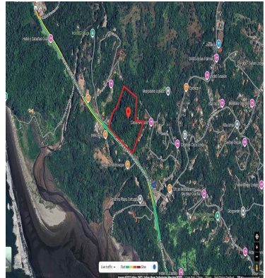
SEE PROPERTY ON GOOGLE MAPS