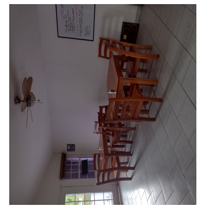
SEE PROPERTY ON GOOGLE MAPS