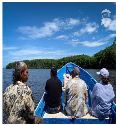
SEE PROPERTY ON GOOGLE MAPS