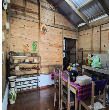
SEE PROPERTY ON GOOGLE MAPS