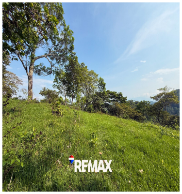
SEE PROPERTY ON GOOGLE MAPS