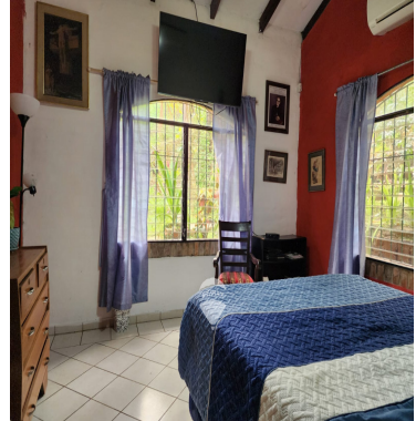
SEE PROPERTY ON GOOGLE MAPS