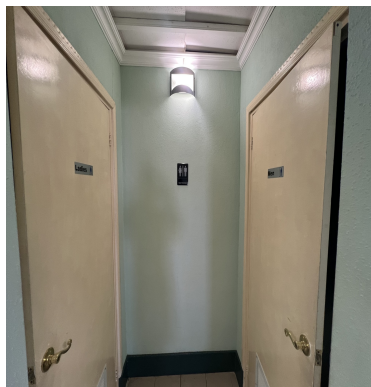
SEE PROPERTY ON GOOGLE MAPS